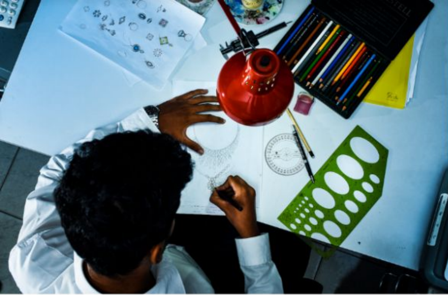
Develop Technical Drawings