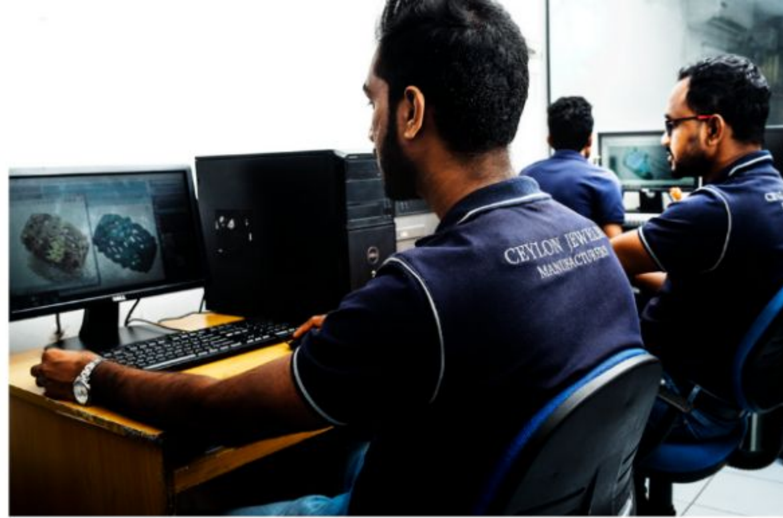
3D CAD / CAM Designing