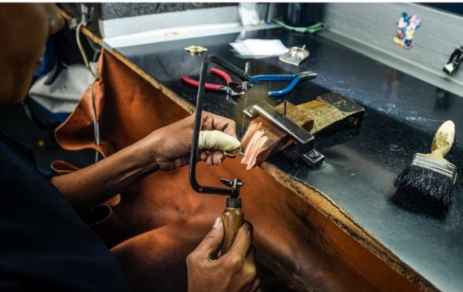
Handmade precious stones and Diamond Jewelry