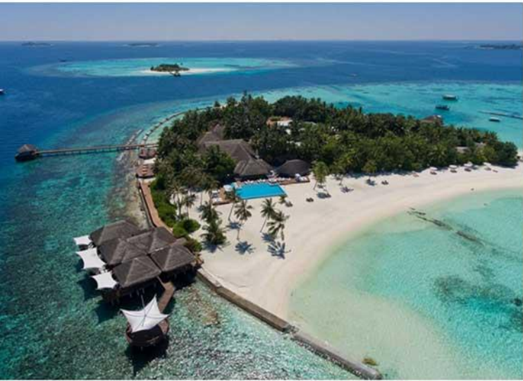
G.D. HOORES VILLA MALDIVES