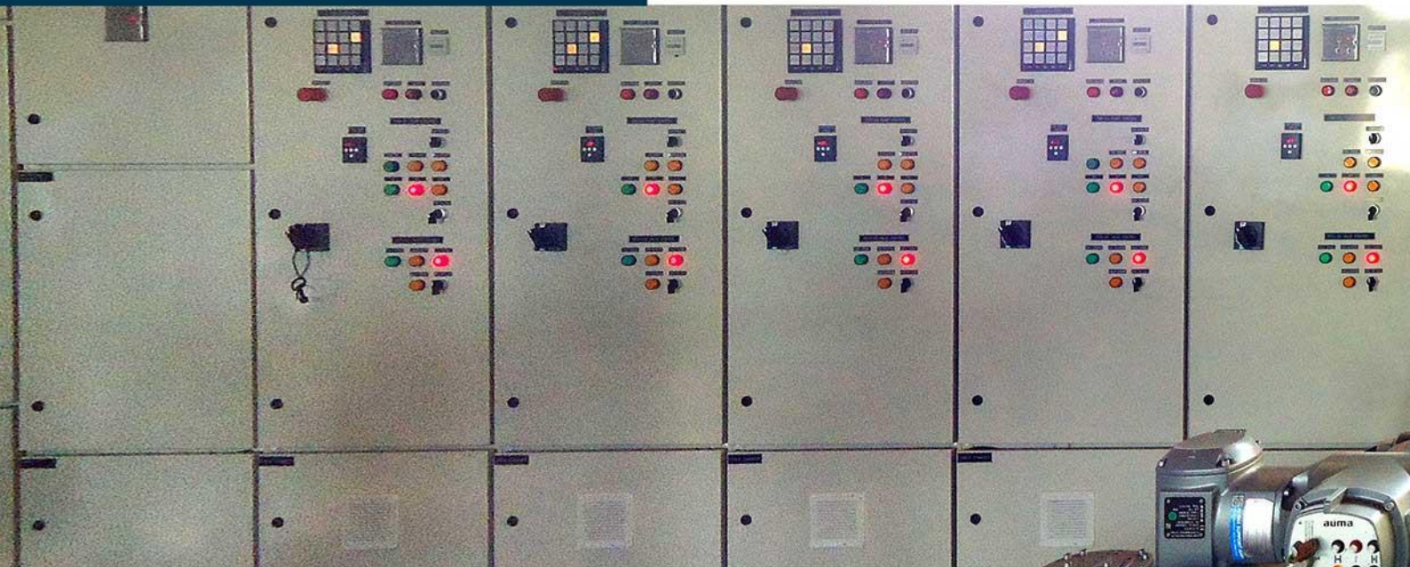
DEHIATHTHAKANDIYA WATER TREATMENT PLANT