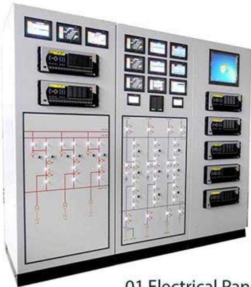
01. Electrical Panel Boards