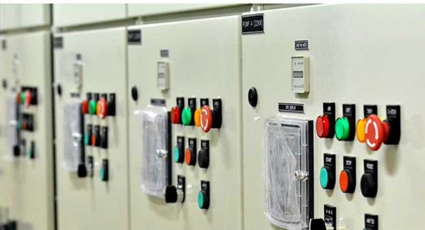
AKKARAIPATTU WATER TREATMENT PLANT