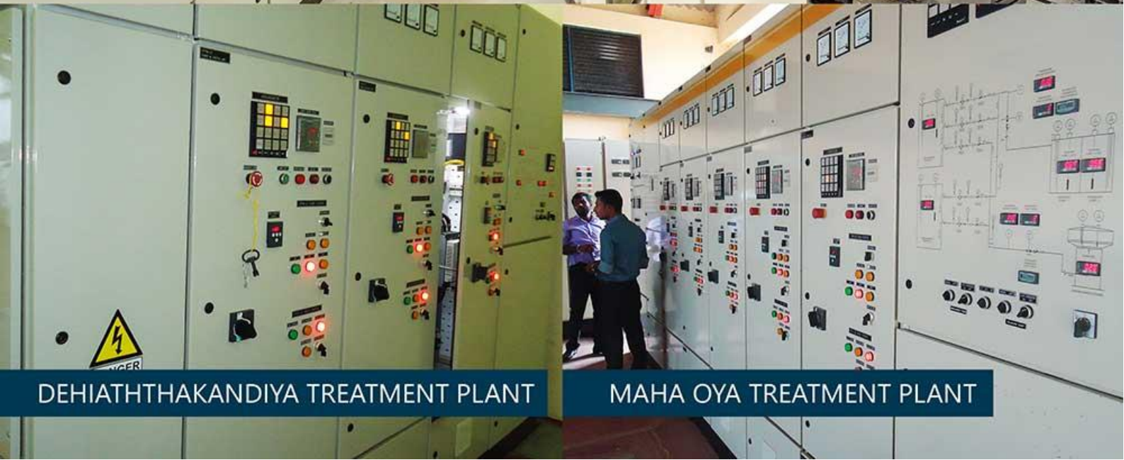
DEHIATHTHAKANDIYA TREATMENT PLANT