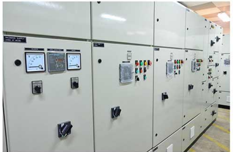
06. Automatic Change Over Switches