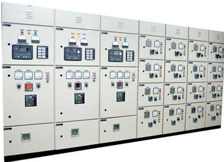
02. Synchronizing Panels