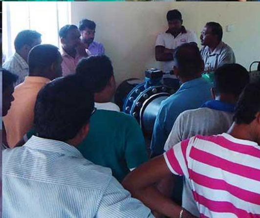
HANDS ON TRAINING