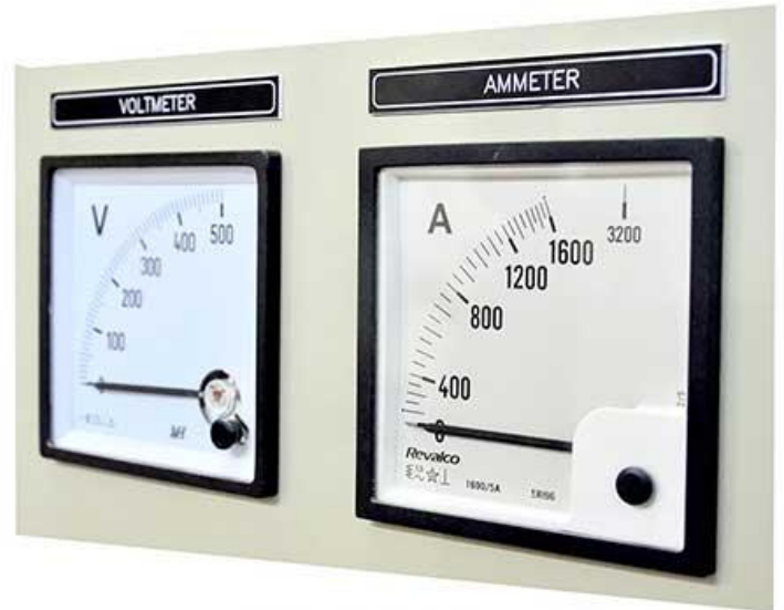
03. Main Switch Boards