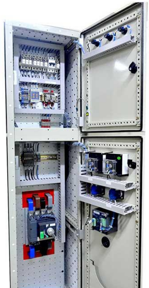
04. Capacitor Banks