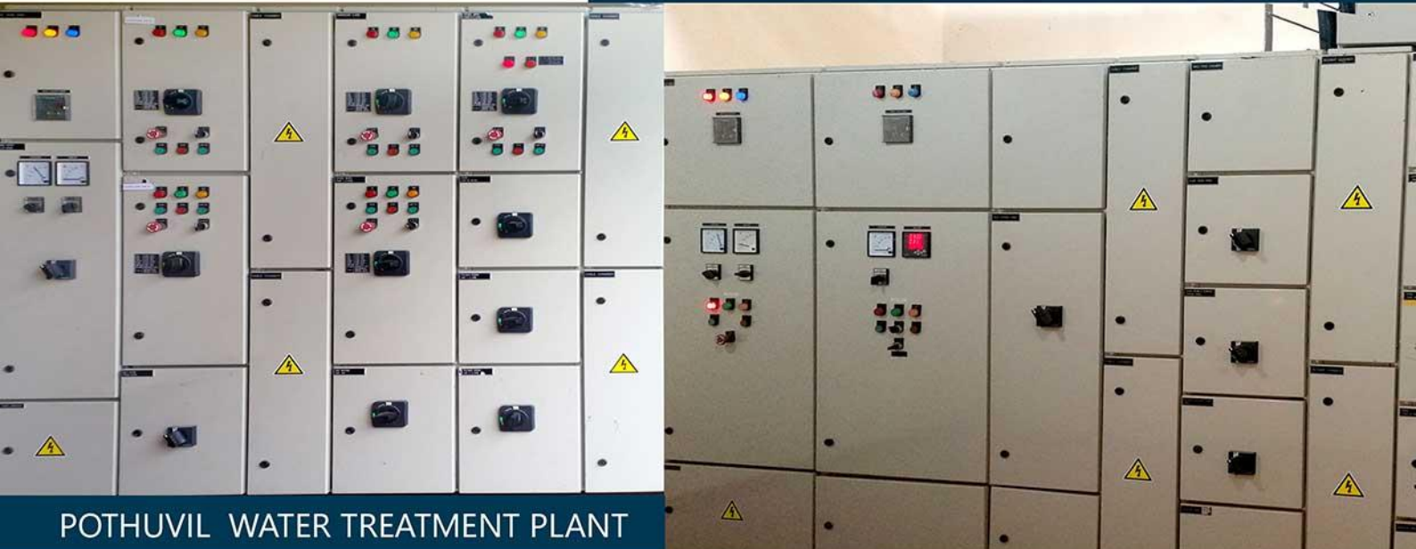
POTHUVIL WATER TREATMENT PLANT