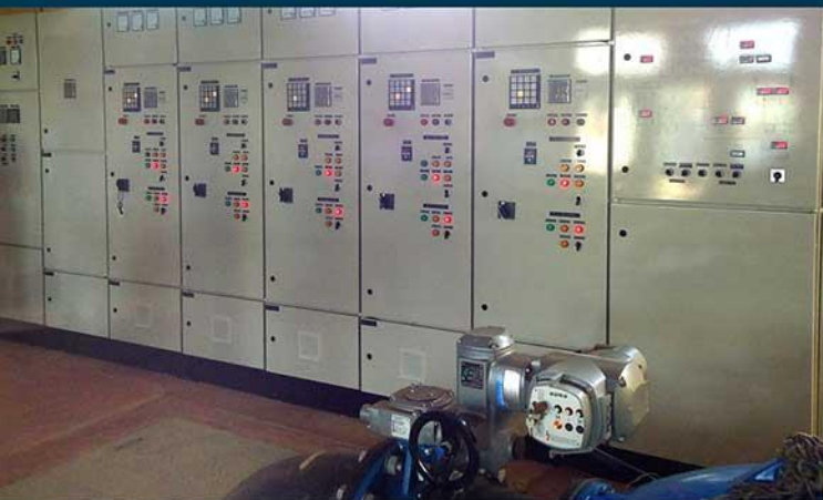
KALMUNAI WATER TREATMENT PLANT