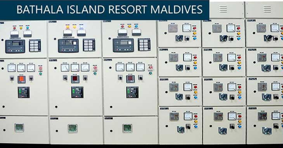
BATHALA ISLAND RESORT MALDIVES