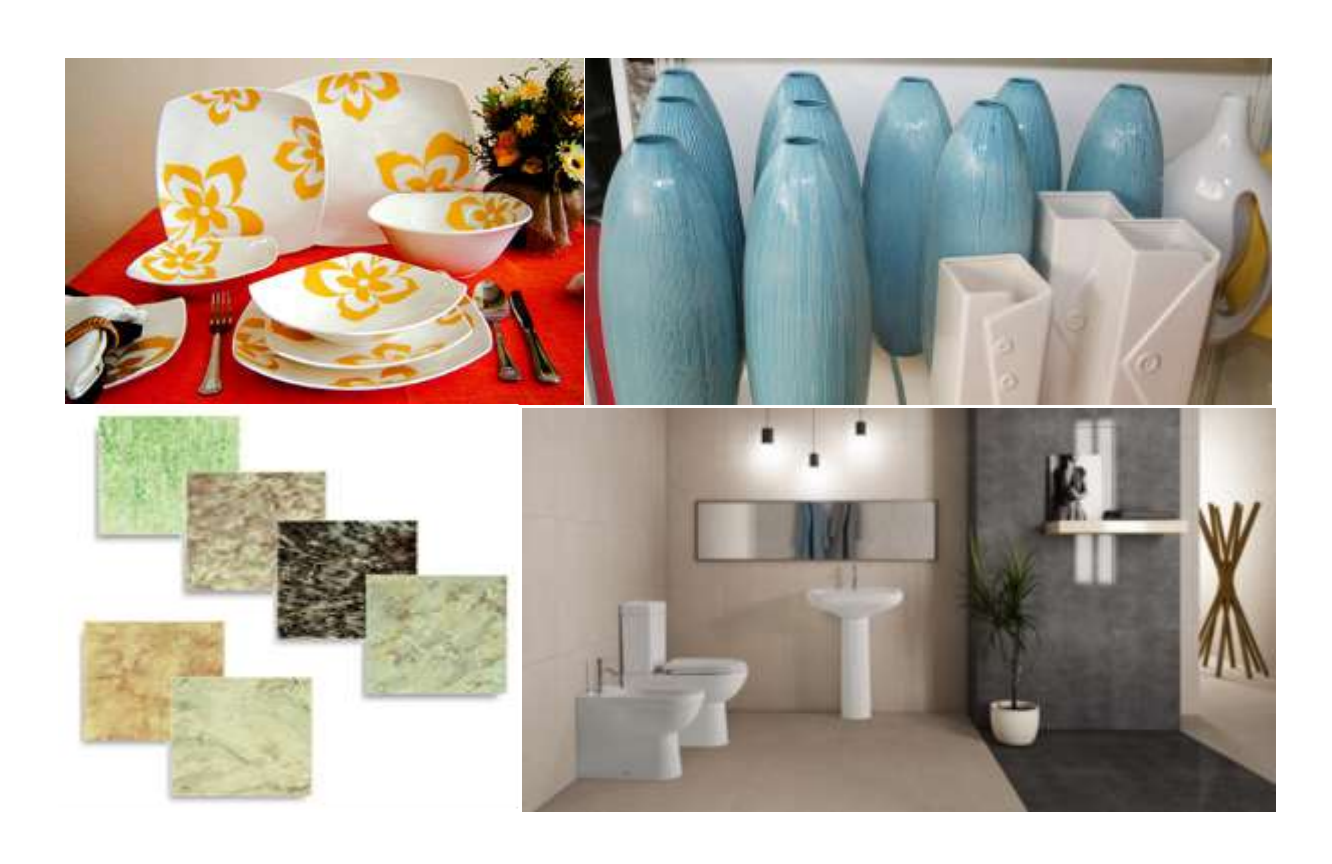
Sri Lankan Ceramic Sector